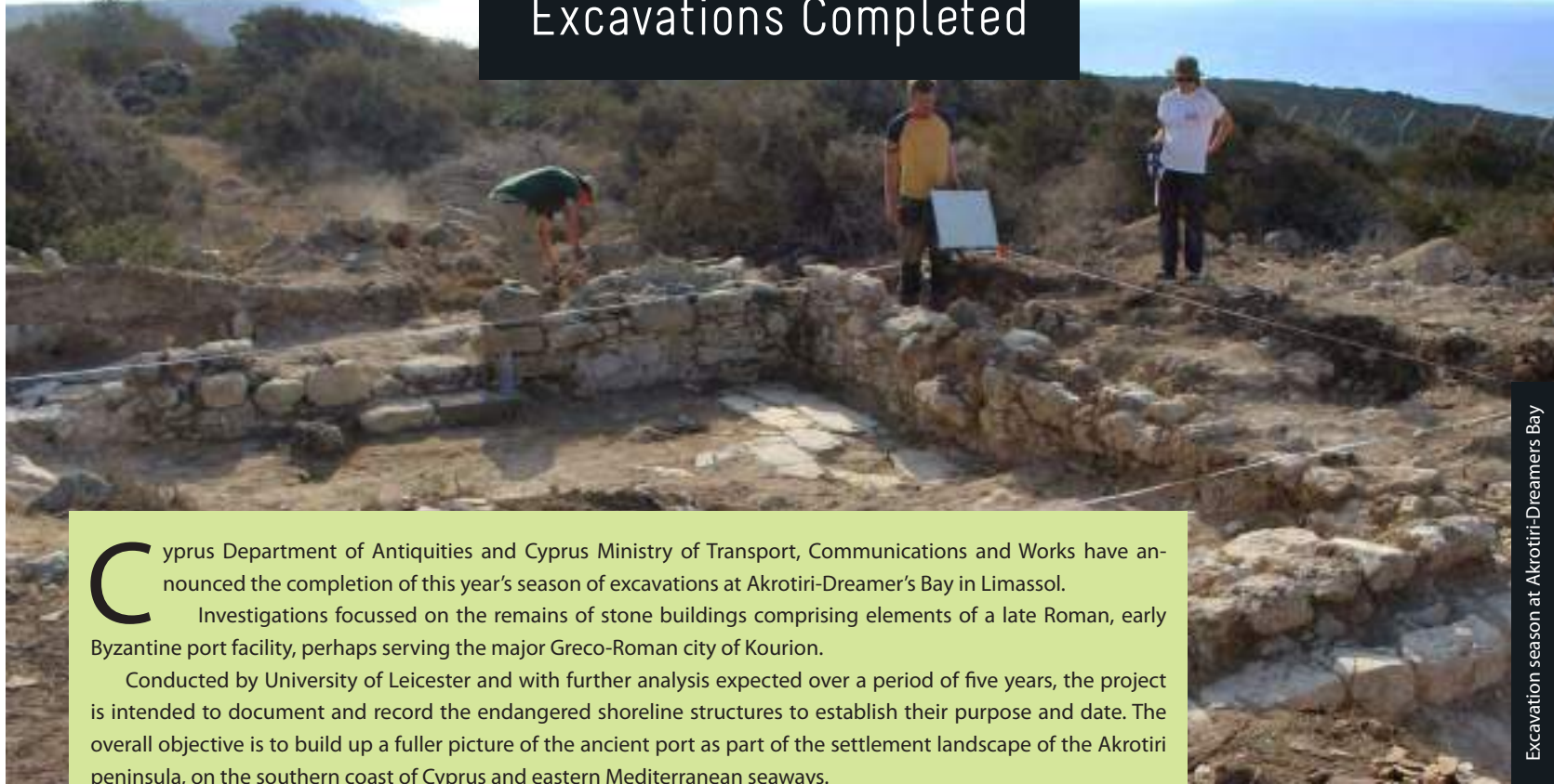
Excavation season at Akrotiri-Dreamers Bay

Cyprus Department of Antiquities and Cyprus Ministry of Transport, Communications and Works have announced the completion of this year's season of excavations at Akrotiri-Dreamer's Bay in Limassol. Investigations focussed on the remains of stone buildings comprising elements of a late Roman, early Byzantine port facility, perhaps serving the major Greco-Roman city of Kourion.