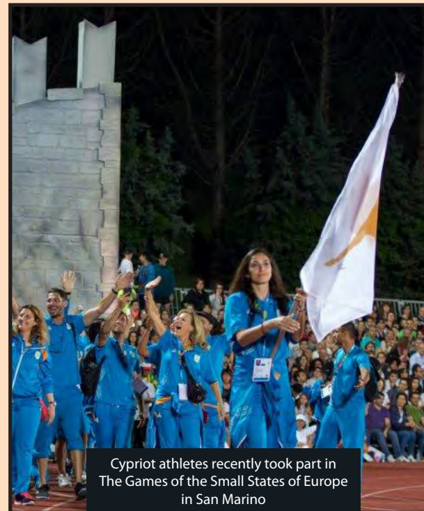
Cypriot athletes recently took part in The Games of the Small States of Europe in San Marino