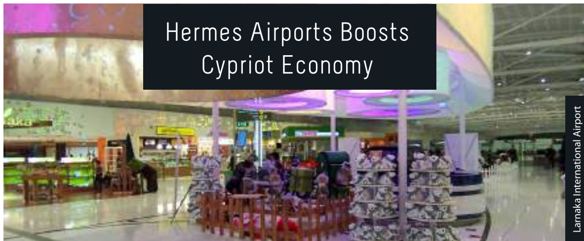
Larnaka International Airport

During Cyprus Investment Promotion Agency (CIPA) International Investment Awards 2017, Bouygues Bâtiment International, the main shareholder of Hermes Airports, was awarded for its significant contribution to the Cypriot economy.