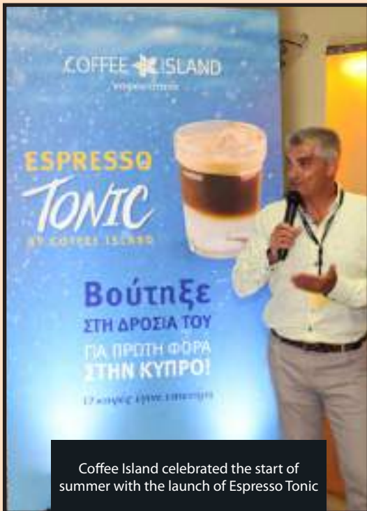
Coffee Island celebrated the start of summer with the launch of Espresso Tonic