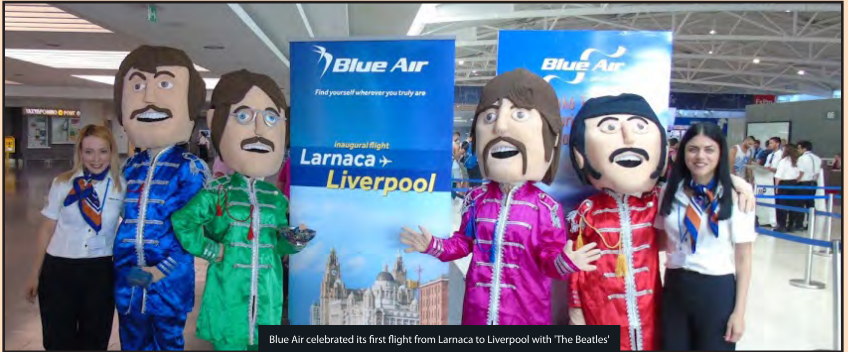
Blue Air celebrated its first flight from Larnaca to Liverpool with 'The Beatles'