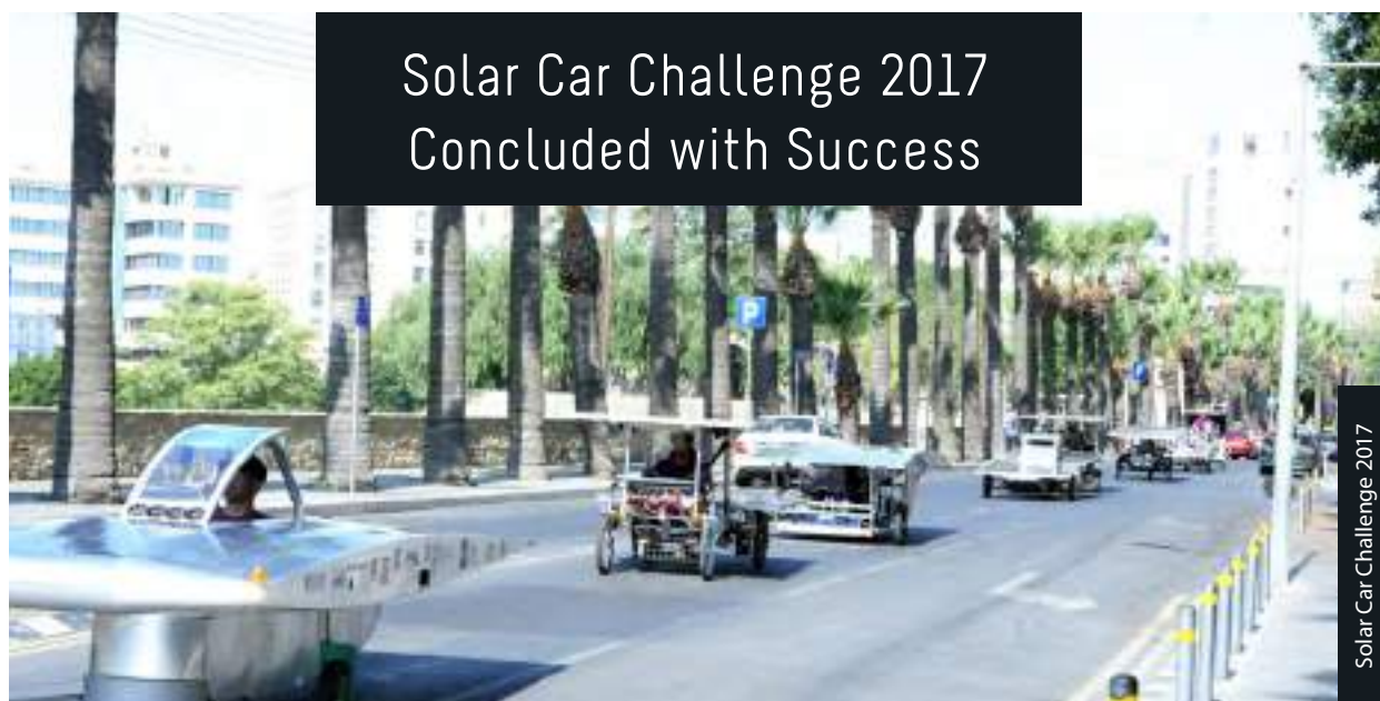
Solar Car Challenge 2017

Aiming to promote the use of renewable energy, The Cyprus Institute and Nicosia Municipality organised the annual Solar Car Challenge 2017 on June 25.