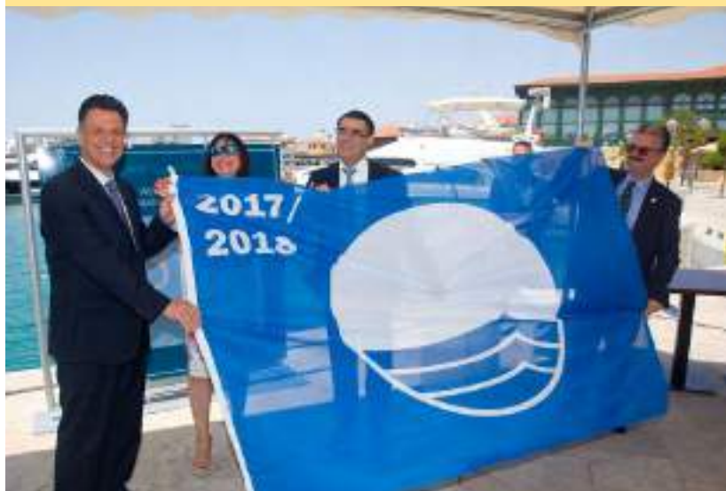
Blue Flag Award Ceremony, Limassol Marina

The world-renowned accolade distinguishes the destination's sustainable facilities and operational procedures, as well as its efforts in promoting environmentally-friendly conduct among visitors, residents and boat owners. The marina will continue maintaining the standards and communicating the regulations to stakeholders in order to ensure that activities conducted on its premises will adhere to the guidelines for clean waters and a safe environment for the marine life in Cyprus.