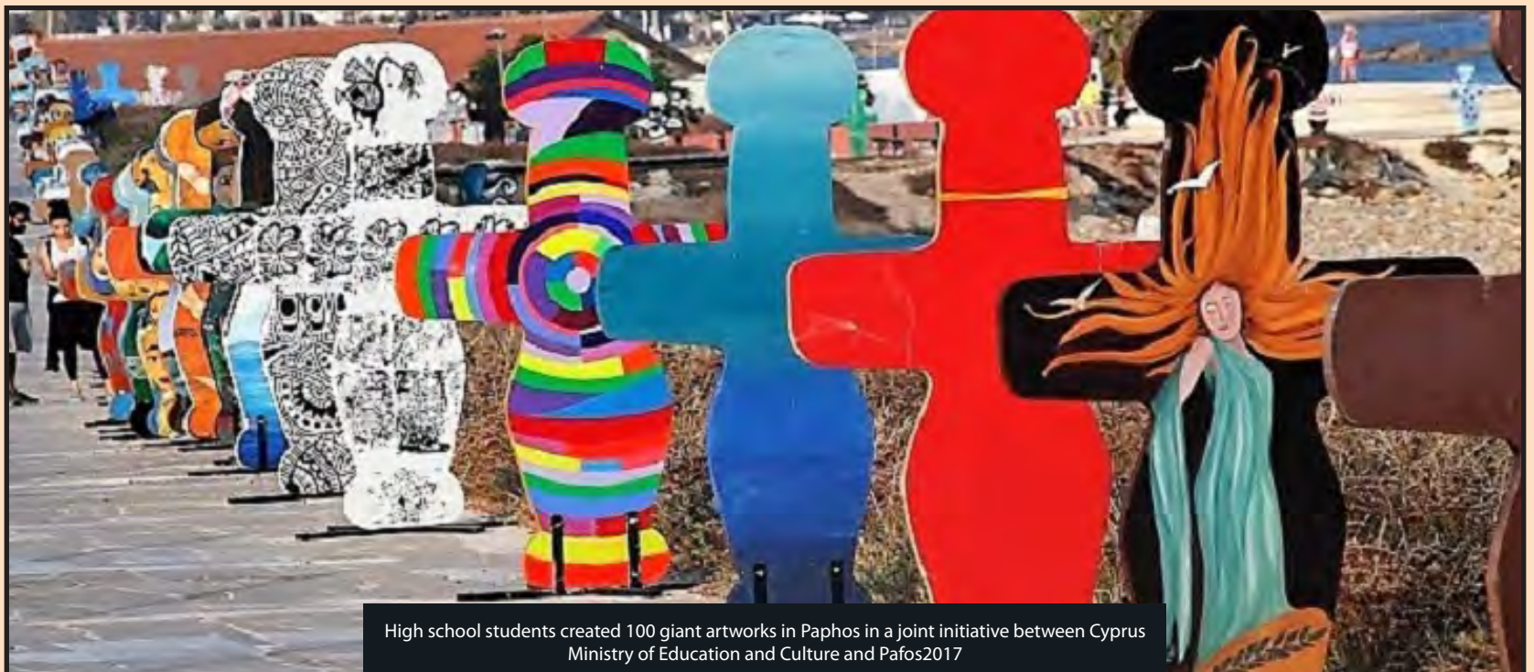
High school students created 100 giant artworks in Paphos in a joint initiative between Cyprus Ministry of Education and Culture and Pafos2017