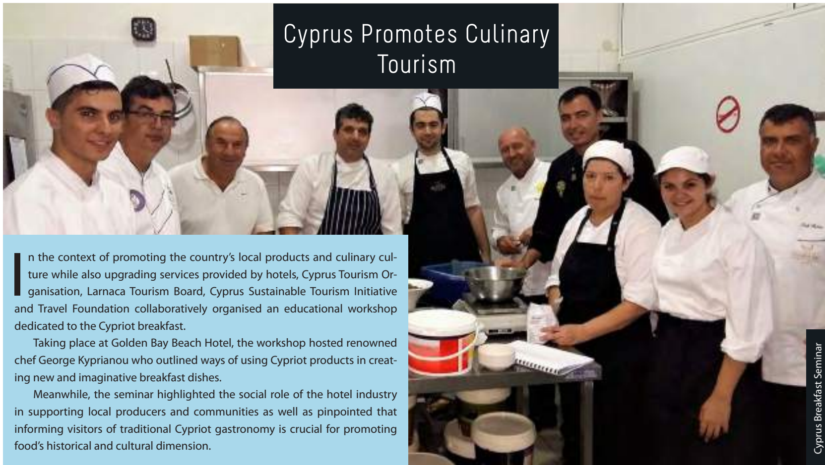
Cyprus Breakfast Seminar

In the context of promoting the country's local products and culinary culture while also upgrading services provided by hotels, Cyprus Tourism Organisation, Larnaca Tourism Board, Cyprus Sustainable Tourism Initiative and Travel Foundation collaboratively organised an educational workshop dedicated to the Cypriot breakfast.